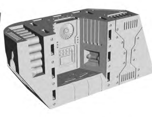
Tail Piece - Mid B.stl