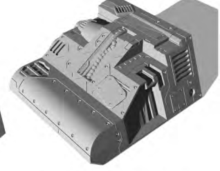
Tail Piece - Wing A.stl