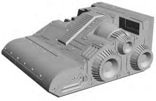
Tail Piece - Wing B.stl