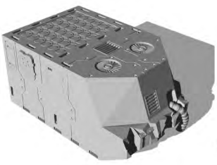
Tail Piece - Base.stl