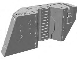
Tail Piece - Mid A.stl