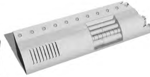
Tail Piece - Base Side A.stl