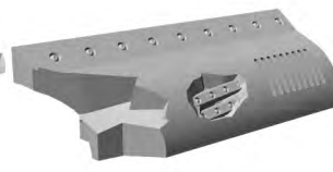
Tail Piece - Base Side B.stl