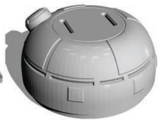
Top A (Sensor Module).stl