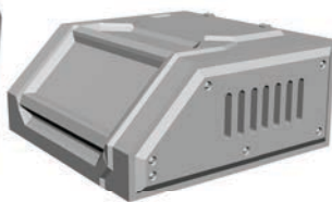
Top C (Cab).stl