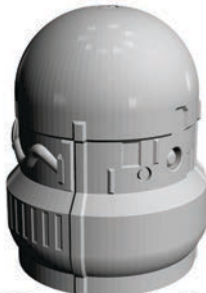
Top C (Fuel Reclamation Tank).stl