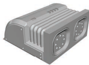
Top D (Module).stl